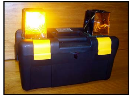
Figure 6 - S.E.A.L. Wig-Wag