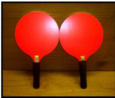
Figure 5 - Arbarr Marshalling Bats