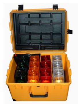
Figure 2 – 12 S.E.A.L. Lites in Storm Case