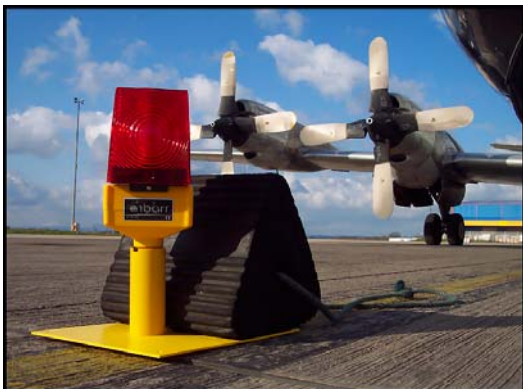
Figure 1 - The S.E.A.L. Lite in use.

The S.E.A.L. System consists of 12 S.E.A.L. Lites, supplied in a storm proof, carrying case (Figure 2). The system can be stored and charged simultaneously, via 12V supply (vehicle lighter socket) or mains electricity (optional). Charging of a case takes approximately 5 hours.