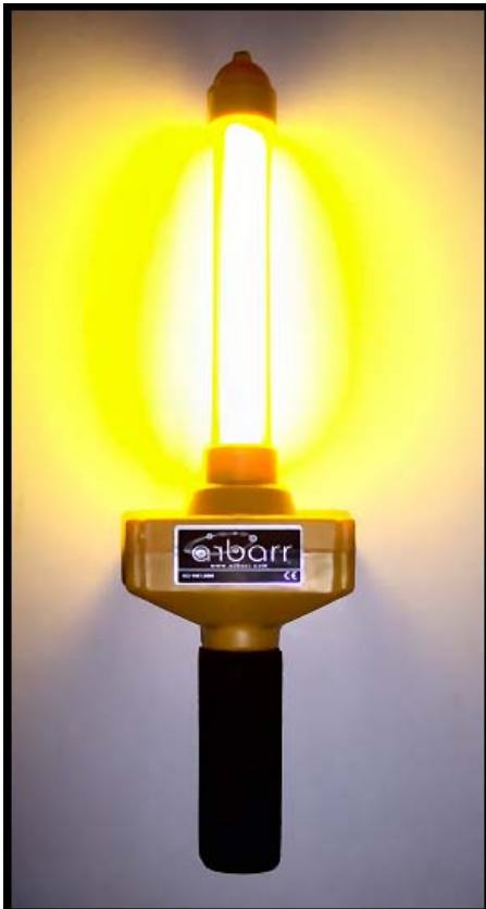
Figure 4 - The S.E.A.L. Wand

The S.E.A.L. Wand (Figure 4) is a rechargeable, multi intensity, marshalling wand.